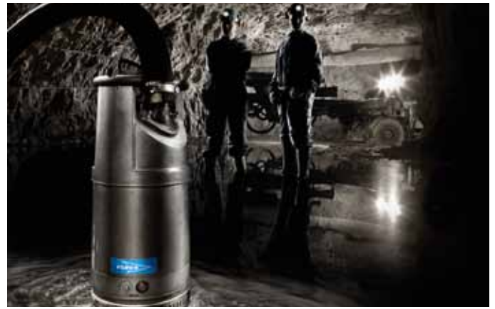
Mine Dewatering Pump