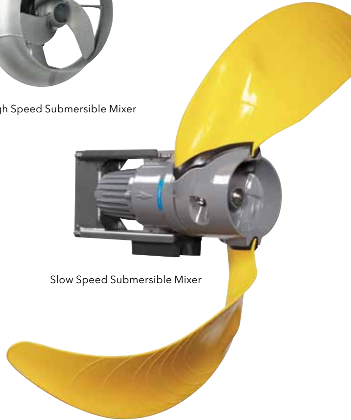
Slow Speed Submersible Mixer