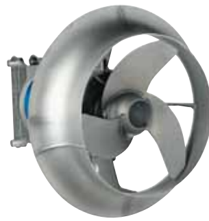
High Speed Submersible Mixer

The compact design of the Flygt submersible mixer gives it an unparalleled degree of freedom to be positioned, allowing the jet to be directed for optimum effectiveness. Free to travel up and down a vertical guide rail, it is easily installed and adjusted to any tank depth. Thanks to the unique adjustable mounting, it can be directed up or down, left or right, precisely where it's needed the most.