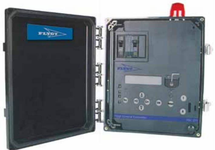
PSS Pump Controller

Best of all, you can order the pump as part of an all-in-one package. That's a pump, plus a prefabricated pit, plus a pump controller in one competitive package – all from a single supplier.