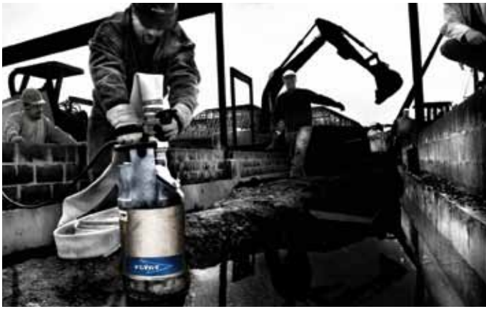
Construction Dewatering Pump