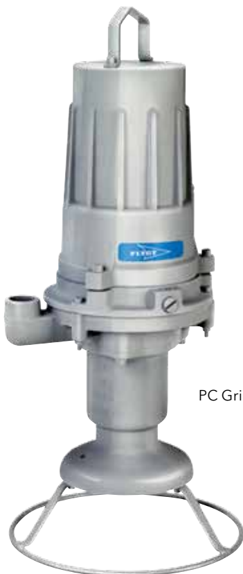
PC Grinder Pump

Flygt PSS MF 3068.175 can accommodate simplex or duplex pumps. PSS package stations are available in 24" diameter and can be installed between 6 and 16 ft. depth. This is made possible thanks to an extension shaft that can be cut to the required length.