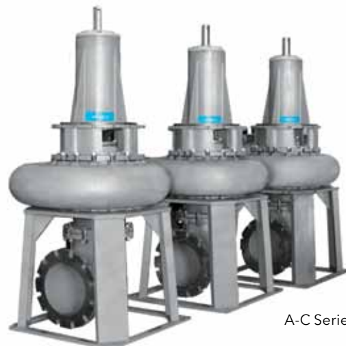
A-C Series Pumps

We also assemble high quality, energy efficient "Custom" products such as Large Split Case, Axial Flow Column and Centrifugal pumps for applications such as Flood Control and Power Plant Cooling.